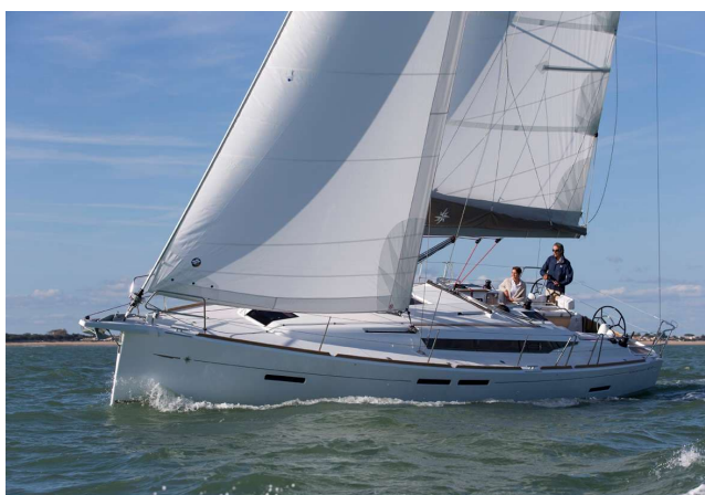
JEANNEAU SUN ODYSSEY 419