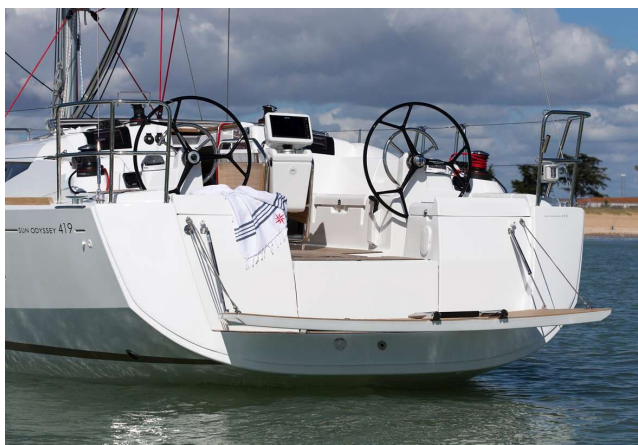
JEANNEAU SUN ODYSSEY 419