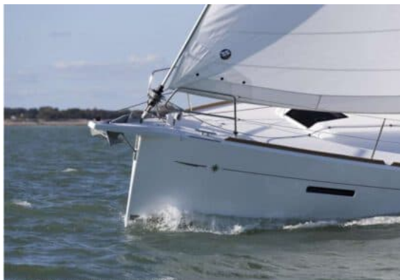
JEANNEAU SUN ODYSSEY 419